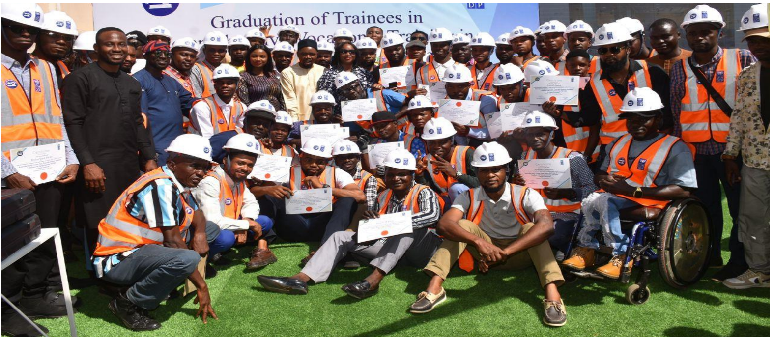
Participants of the AFS/UNDP solar training