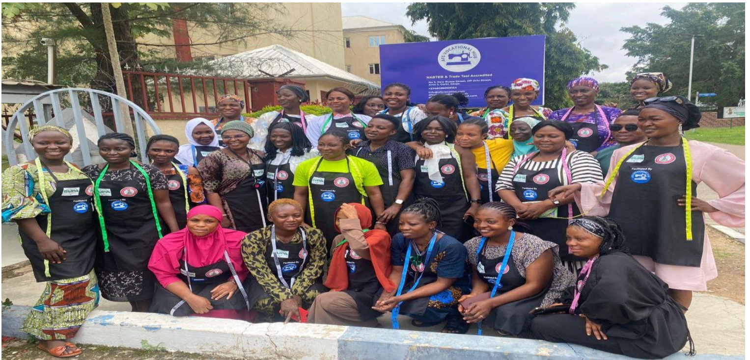
Some participants of the ITF SUPA training