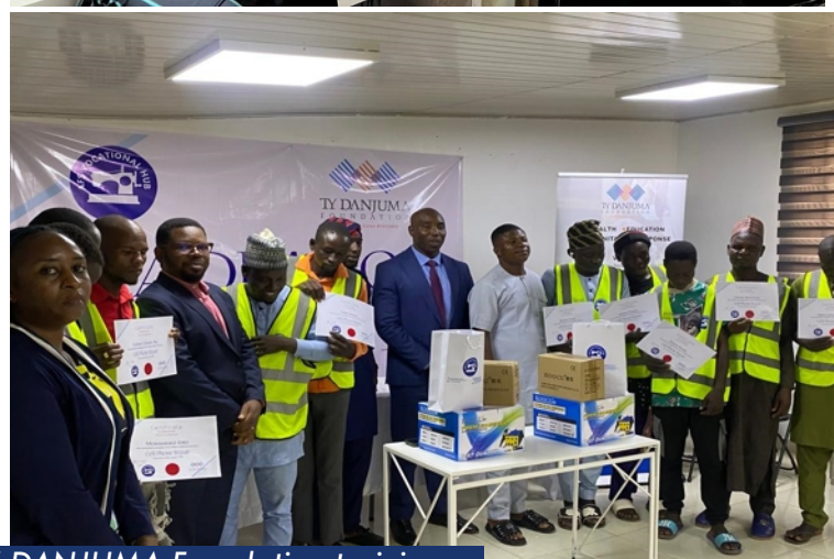
Some participants of the AFS / TY DANJUMA Foundation training