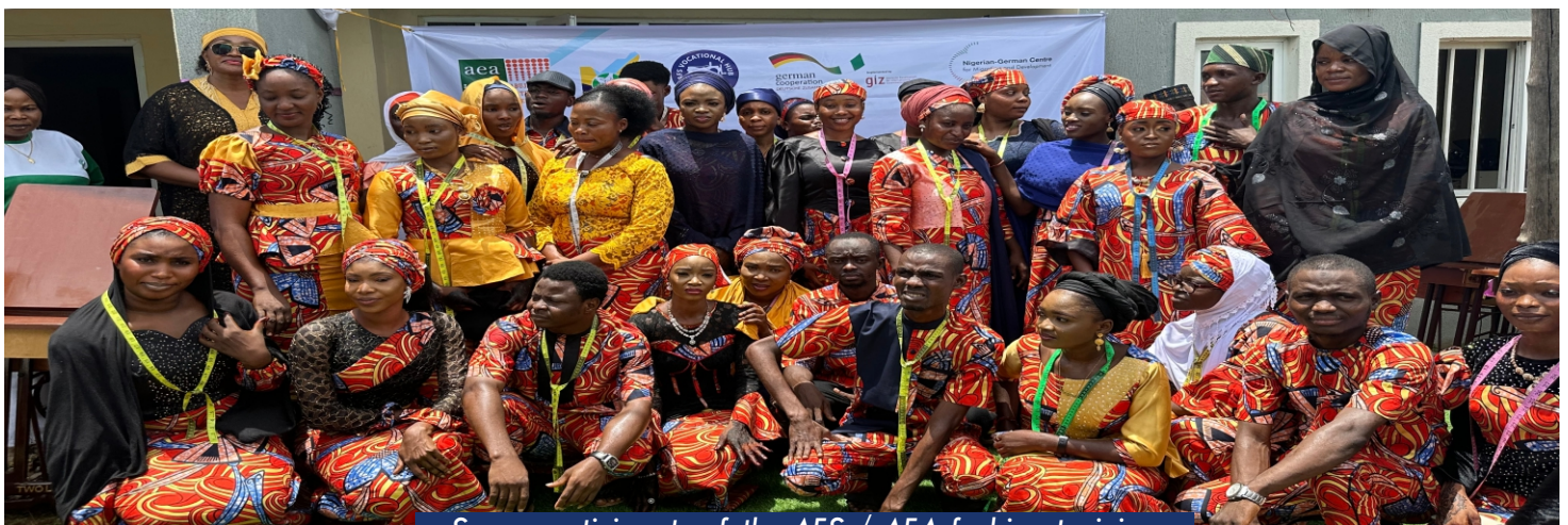
Some participants of the AFS / AEA fashion training